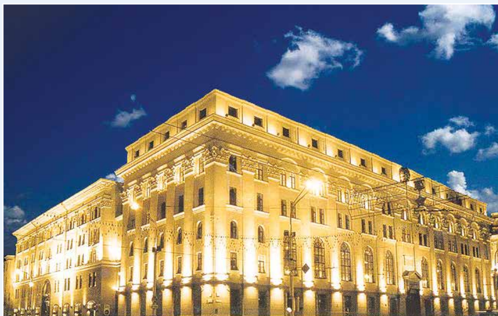
The National Bank of the Republic of Belarus Administration building