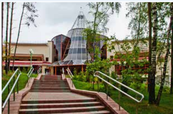
Training centre of the National Bank of the Republic of Belarus (village of Raubichi)