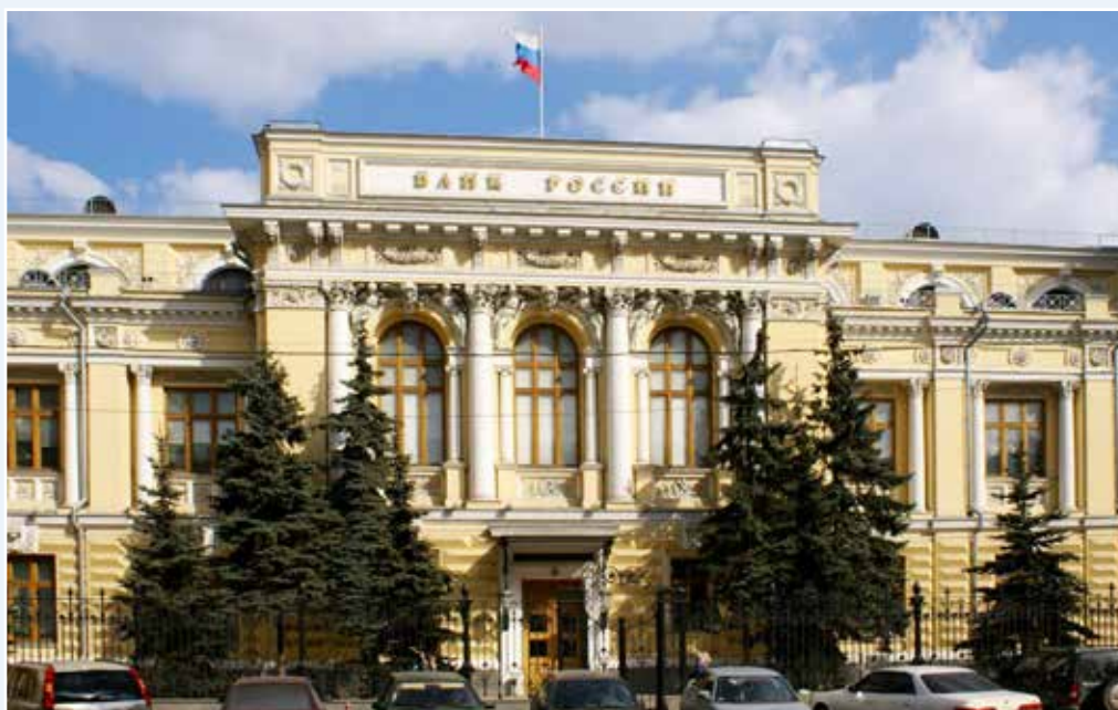
The Central Bank of the Russian Federation (The Bank of Russia) Administration building