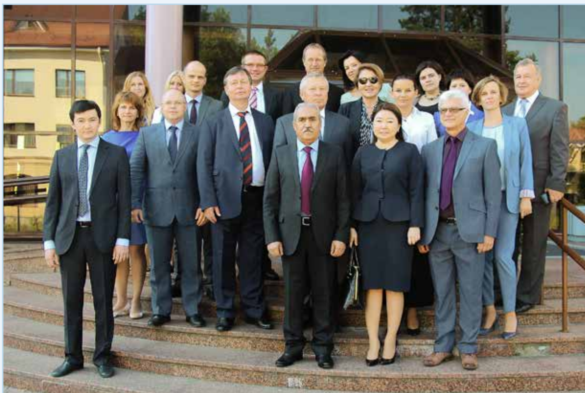
Participants of the 22 nd meeting of the Coordination Board on Professional Training for Personnel of the Central (National) Banks of EAEU Member States 25-26 August 2015, Minsk