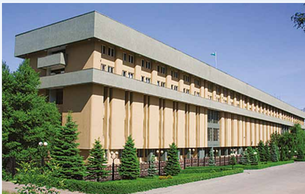
The National Bank of the Republic of Kazakhstan Administration building