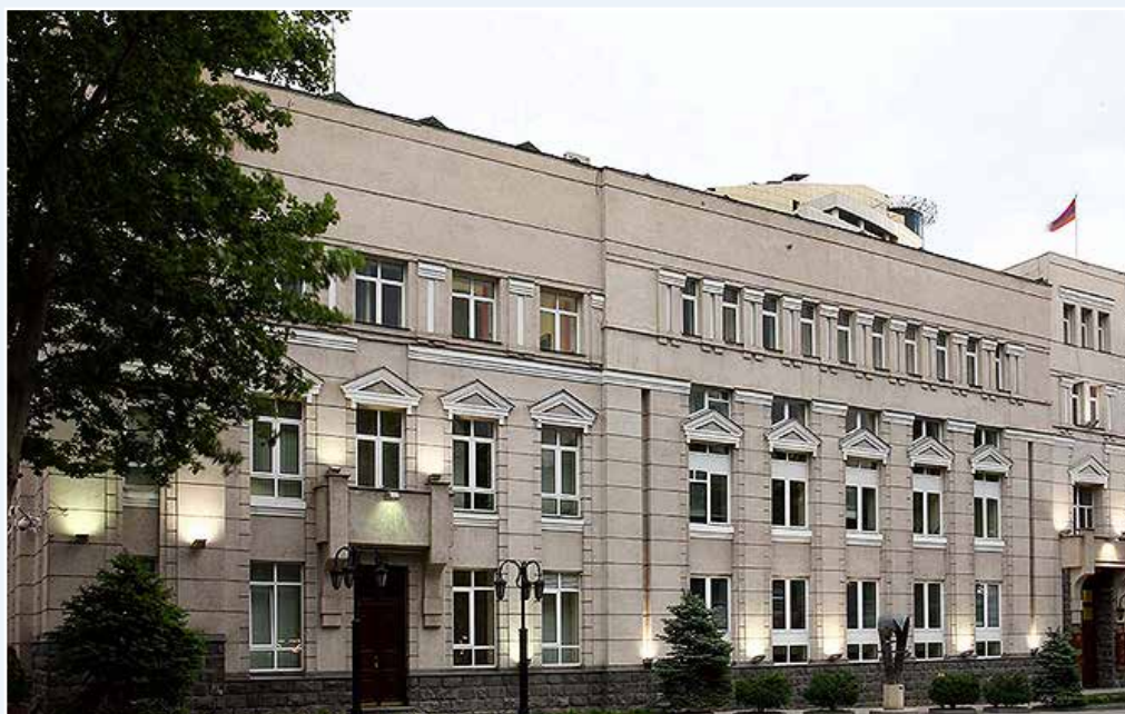
The Central Bank of the Republic of Armenia Administration building