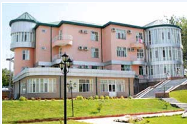
Training and Healthcare Centre of the National Bank of Tajikistan (Kayrakkum)