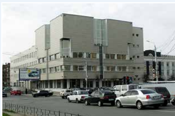
The Interregional Training Centre The Bank of Russia (Tula)