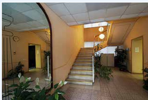
The hall of the Training and Accommodation Building

The Personnel Training Centre of the Bank of Russia is the principal training institution in the Bank of Russia system for professional development. The Centre provides training for executives and employees of the central office and regional branches of the Bank of Russia, including training events with participation of foreign central banks and international organisations representatives.