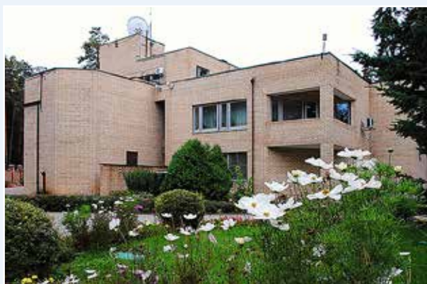
The Personnel Training Centre of the Bank of Russia