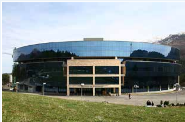
Training and Research Centre Central Bank of the Republic of Armenia (Dilijan)