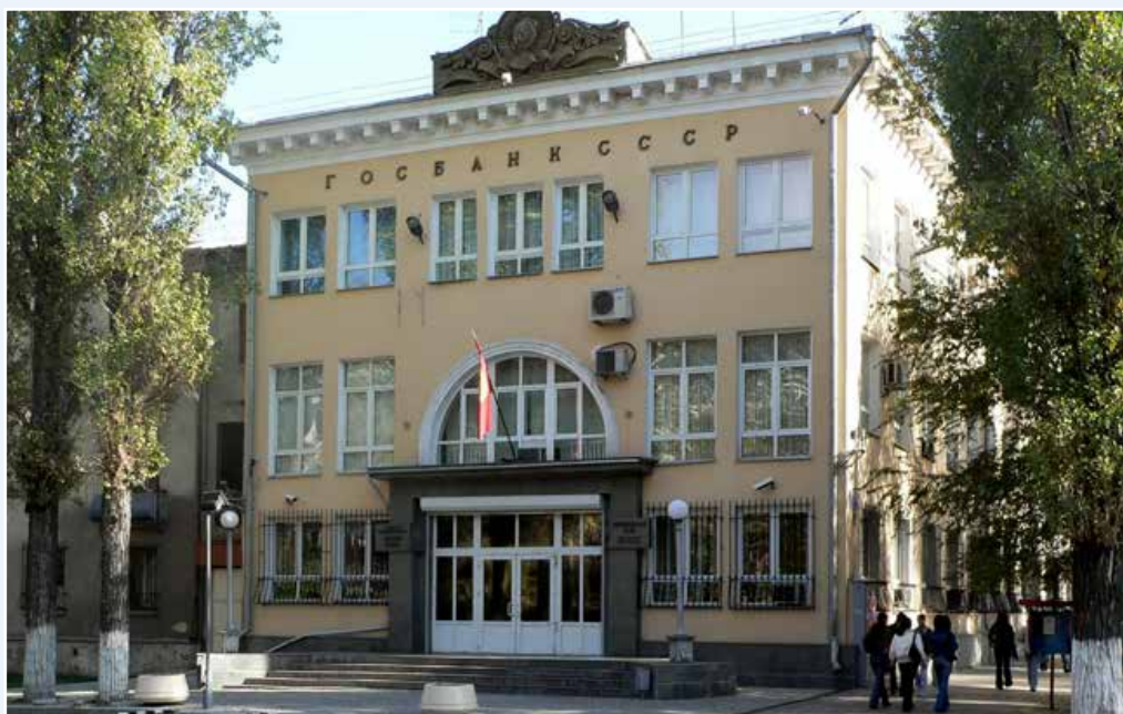
The National Bank of the Kyrgyz Republic Administration building