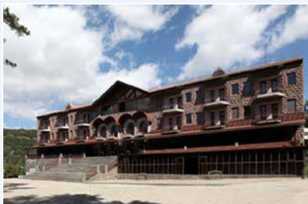
Training Centre of the Central Bank of the Republic of Armenia (Tsakhkadzor)