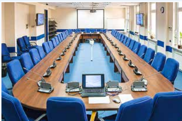
Small conference hall