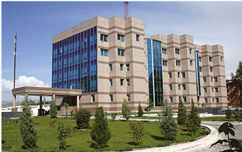
The National Bank of Tajikistan Administration building