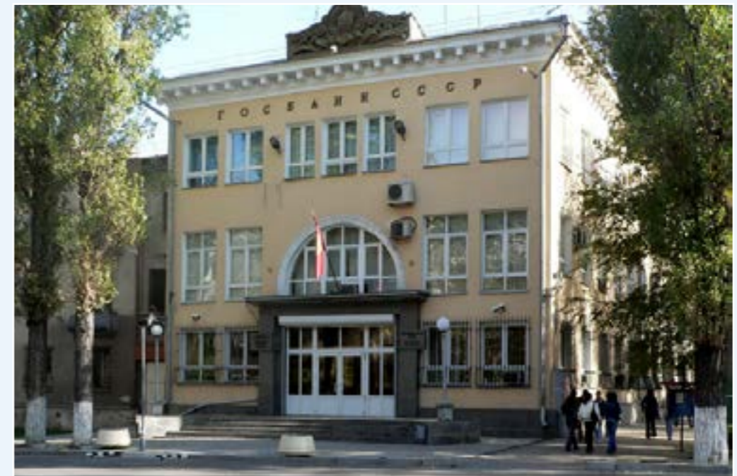
The National Bank of the Kyrgyz Republic Administrative building