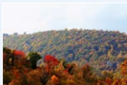
In the vicinities of Tsakhkadzor

The Training Centre is a structural unit of the Central Bank of the Republic of Armenia.