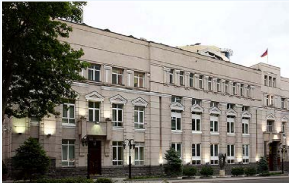
The Central Bank of the Republic of Armenia Administrative building