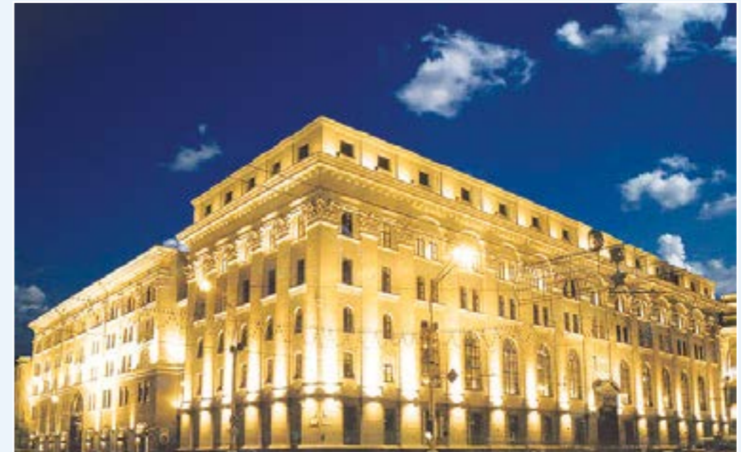
The National Bank of the Republic of Belarus Administrative building