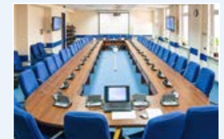
Small conference hall