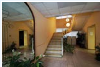
The hall of the Training and Accommodation Building

The Staff Training Centre of the Bank of Russia is the principal training institution in the personnel skill improvement system of the Bank of Russia. The Centre provides training for executives and employees of the central administration and regional branches of the Bank of Russia.