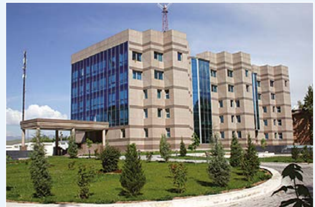
The National Bank of Tajikistan Administrative building