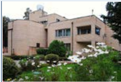
Staff Training Centre of the Bank of Russia