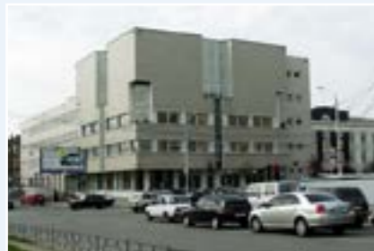
Interregional Training Centre of the Bank of Russia (Tula)