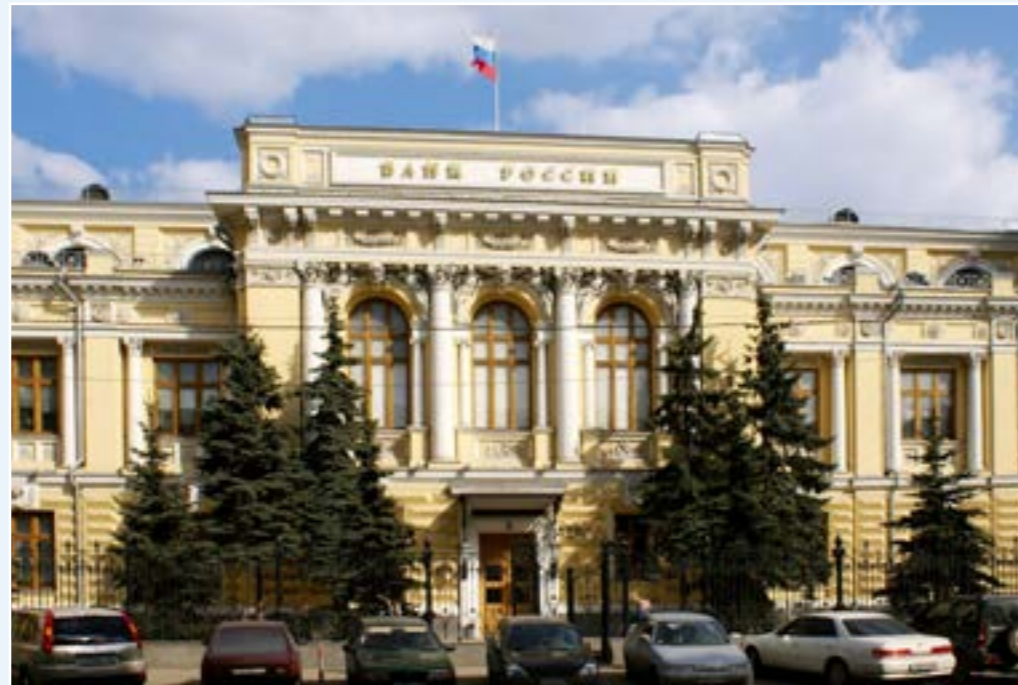
The Central Bank of the Russian Federation Administrative building

The National Bank of Tajikistan 734003, Republic of Takijistan, Dushanbe, pr. Rudaki, 107a Fax: (992 44) 600-32-35