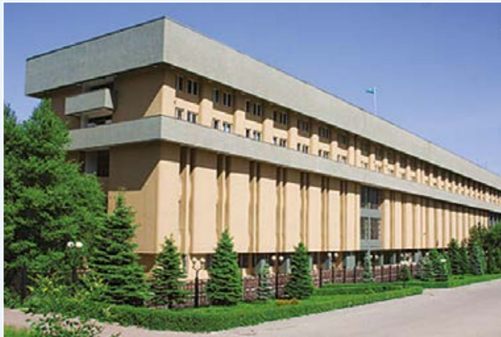
The National Bank of the Republic of Kazakhstan Administrative building

The National Bank of the Kyrgyz Republic 720040, Kyrgyz Republic, Bishkek, ul. T. Umetaliyeva, 101 Fax: (996 312) 61-07-30, 61-52-86, 66-92-04