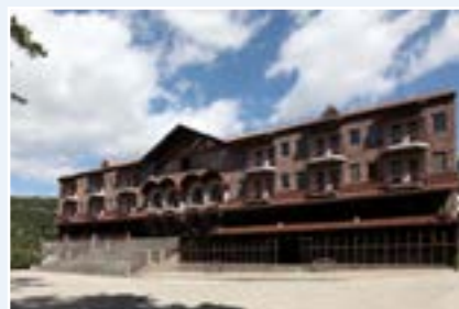
Training Centre of the Central Bank of the Republic of Armenia (Tsakhkadzor)