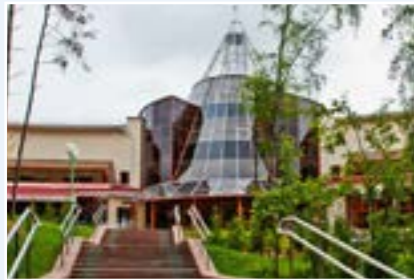
Training Centre of the National Bank of the Republic of Belarus (village of Raubichi)