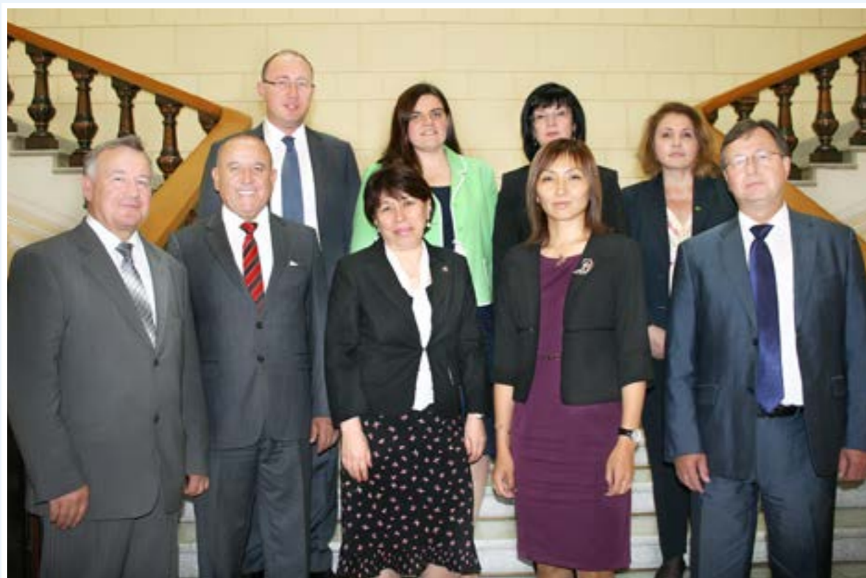
Participants of the 18th meeting of the Coordination Board on Professional Training for Personnel of the Central (National) Banks of EurAsEC Member States 28-30 August 2013

The training objective is to provide systematic skill improvement opportunities for executives and experts of central (national) banks of EurAsEC Member States in relevant banking areas, and to optimize respective efforts of central (national) banks of EurAsEC Member States.