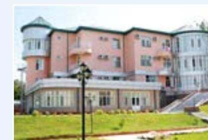
Training and Healthcare Centre of the National Bank of Tajikistan (Kayrakkum)