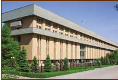
National Bank of the Republic of Kazakhstan Administrative building

Fax: (7 727) 261-73-52, 270-47-03, 270-47-99, 270-46-15