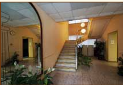
The hall of the Training and Accommodation Building

The Personnel Training Centre of the Bank of Russia is the principal training institution in the personnel skill improvement system of the Bank of Russia. The Centre provides training for executives and employees of the central administration and regional branches of the Bank of Russia.