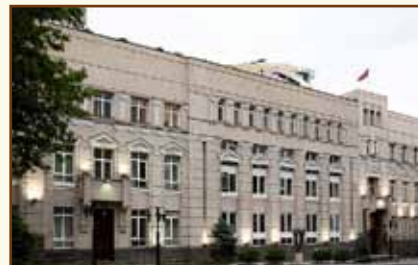
Central Bank of the Republic of Armenia Administrative building