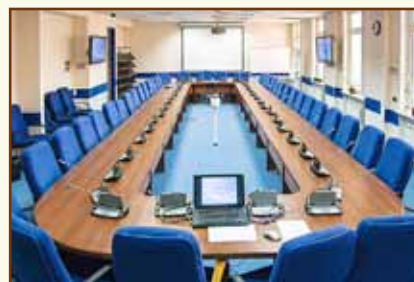
Small conference hall