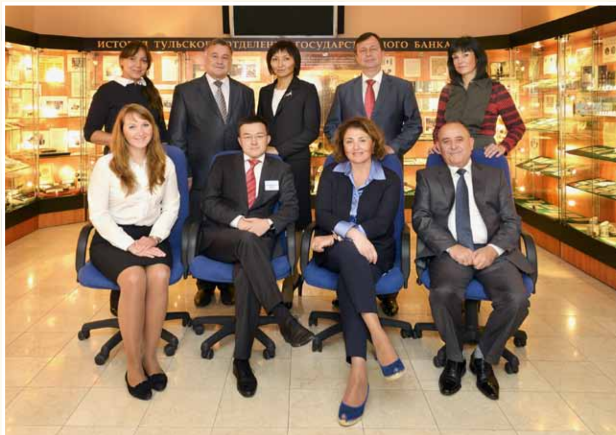
Participants of the 16 th meeting of the Coordination Board on Professional Training for Personnel of the Central (National) Banks of EurAsEC Member States 28-30 August 2012

The training objective is to provide systematic continuing educations to executive officers and employees of the central (national) banks of EurAsEC Members States in priority banking areas and streamline relevant efforts made by the central (national) banks of EurAsEC Members States.