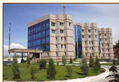
National Bank of Tajikistan Administrative building