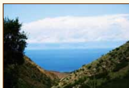
View of the Lake of Issyk-Kul in the vicinities of the village of Bosteri