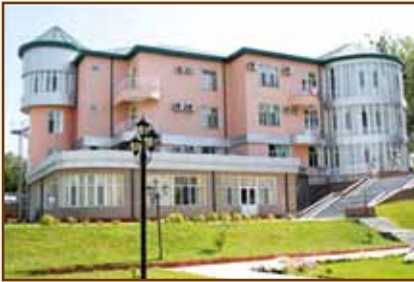
Training and Healthcare Centre of the National Bank of Tajikistan (Kayrakkum)