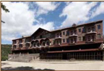
Training Centre of the Central Bank of the Republic of Armenia (Tsakhkadzor)