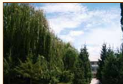
Tolkun Recreation Centre of the National Bank of the Kyrgyz Republic (Bosteri)

phone: (996 3943) 3-53-47, (996 550) 57-87-51