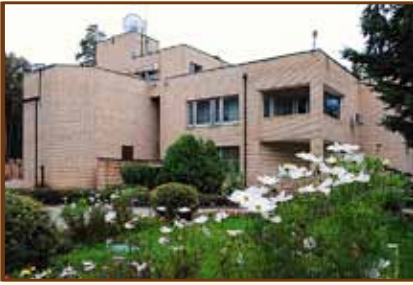
Personnel Training Centre of the Bank of Russia