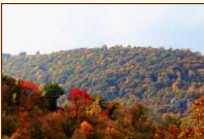
In the vicinities of Tsakhkadzor

The Training Centre is a structural unit of the Central Bank of the Republic of Armenia.