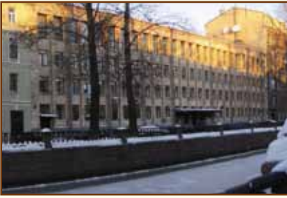
Saint Petersburg Banking School (College) of the Bank of Russia