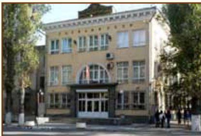
National Bank of the Kyrgyz Republic Administrative building

Fax: (996 312) 61-07-30, 61-52-86, 66-92-04