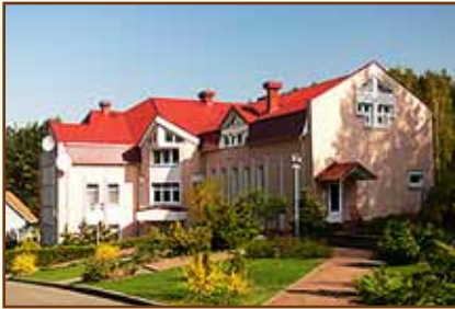
Training Centre of the National Bank of the Republic of Belarus (village of Raubichi)