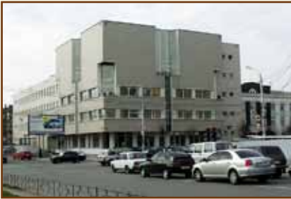
Interregional Training Centre of the Bank of Russia (Tula)