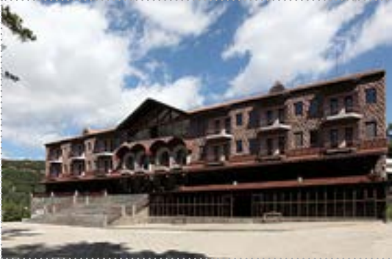
Training Centre of the Central Bank of Armenia (Tsakhkadzor)