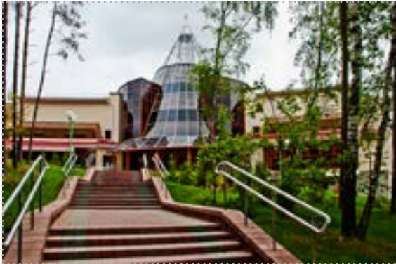
Training Centre of the National Bank of the Republic of Belarus (Raubichi)