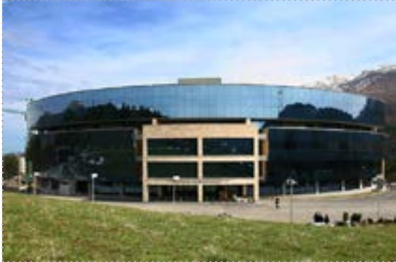
Training and Research Centre of the Central Bank of Armenia (Dilijan)