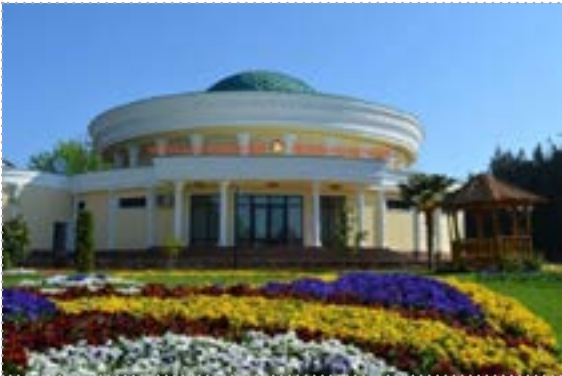
Training Centre of the National Bank of Tajikistan (Guliston)