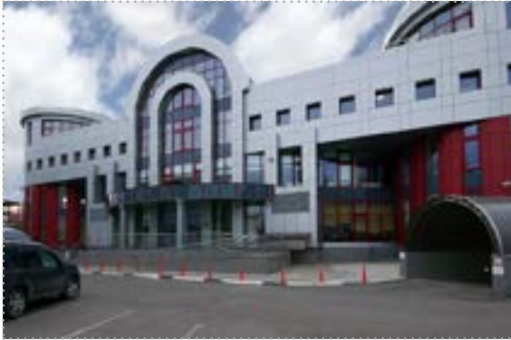
University of the Bank of Russia