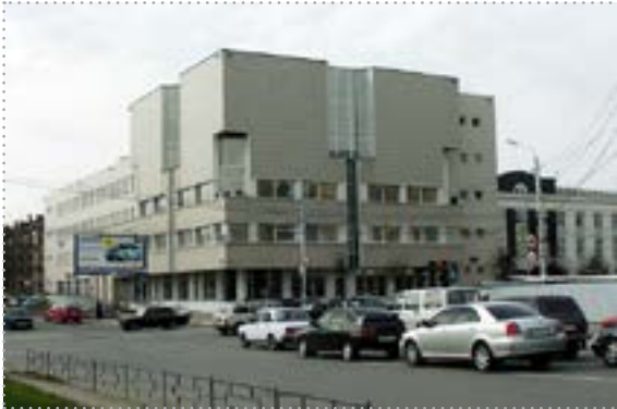
Interregional Training Centre (Tula) of the University of the Bank of Russia