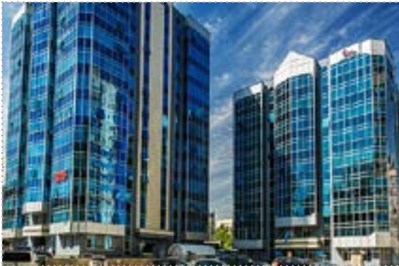
Training Centre of National Bank of the Republic of Kazakhstan (Almaty)